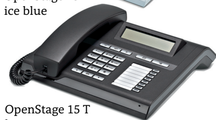
OpenStage 15 T lava