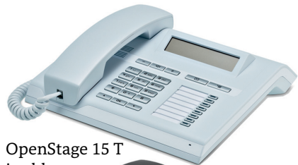
OpenStage 15 T ice blue