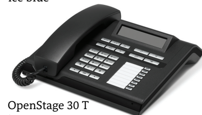
OpenStage 30 T lava