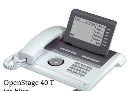
OpenStage 40 T ice blue