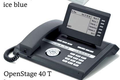
OpenStage 40 T lava