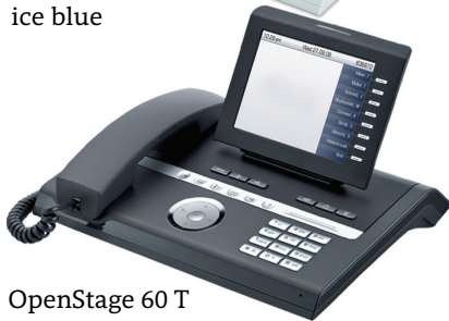
OpenStage 60 T lava