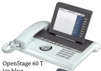
OpenStage 60 T ice blue