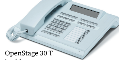
OpenStage 30 T ice blue