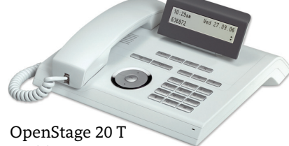
OpenStage 20 T ice blue