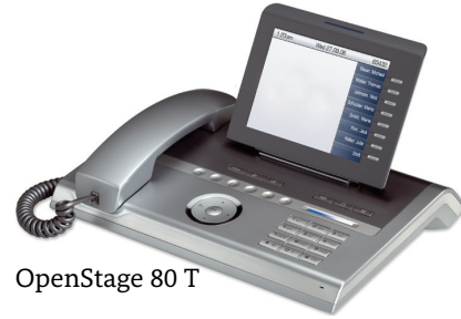
OpenStage 80 T