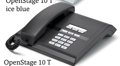
OpenStage 10 T lava