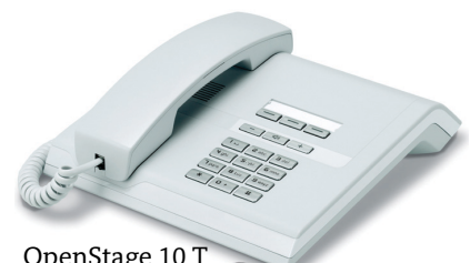
OpenStage 10 T ice blue